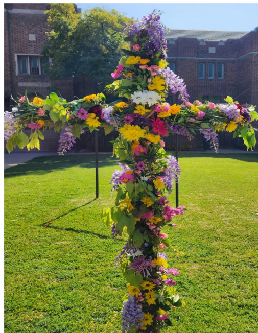
Calvary Presbyterian Church Outdoor Cross last year!

Join us for the Flowering of the Easter Cross on Easter morning March 31, 2024, and help Decorate our Cross on Calvary's Front Lawn to celebrate Jesus overcoming death.