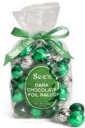
DarkChocolate Foil Balls