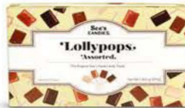
Assorted Lollypops Box of approx 30 Vanilla, Butterscotch, Café Latté and Chocolate