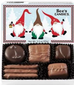
Merry Gnome Box