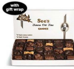
Nuts and Chews