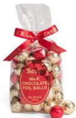
Milk Chocolate Foil Balls