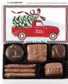
Christmas Delivery Box