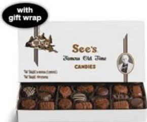
Asst Chocolates Soft Centers